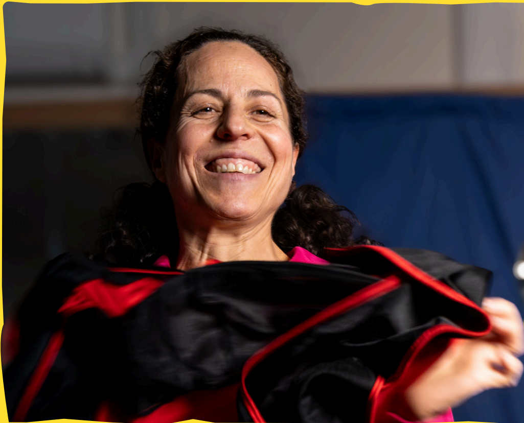
Coco the Belgian Chocolate performs the Can Can.

Coco arrives and auditions by performing the "Can Can" , She invites the audience to clap along as she kicks her legs high in the air.