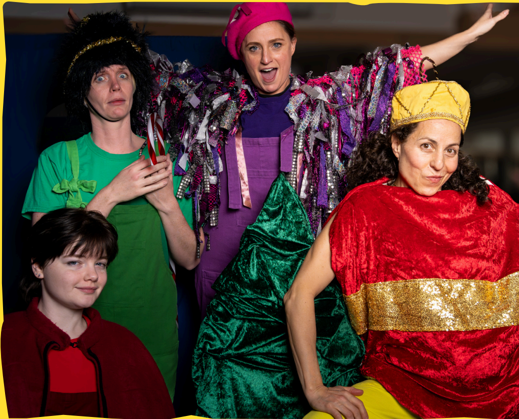
Wise Woman, Toy Soldier, Tina Tinsel & Bob the Bauble.

The Decorations on the tree come to life and notice that Fairy is broken.