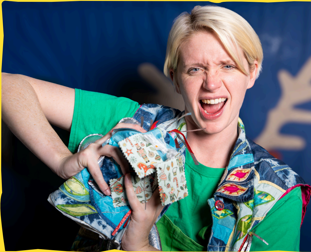
Wrapping P performing the Scrunch Test.

Wrapping Paper, arrives and auditions by performing the Wrapping Paper Rap and Tina joins in singing .